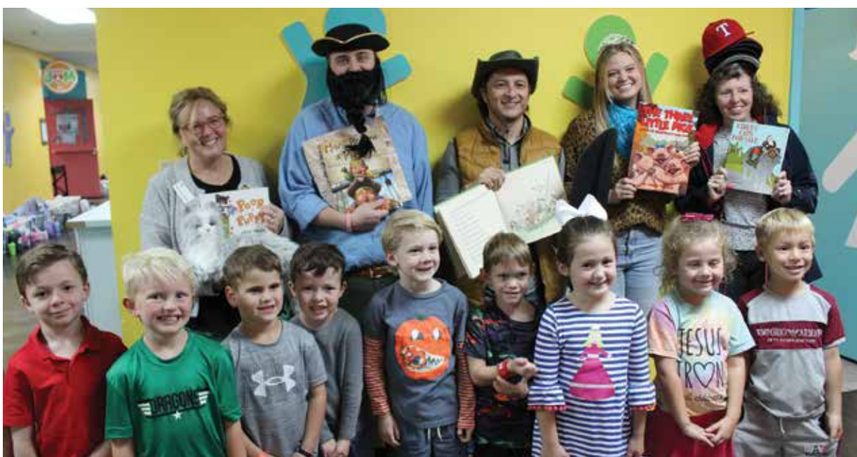
Several of the White's Chapel pastors dressed up as their favorite Children's book characters as Chapel Hill students were treated to story time on a recent Monday.